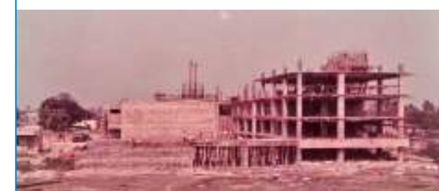
Madhusudan Manch Under Construction at Dhakuria

Merlin Cambridge (B+G+25) Prince Anwar Shah Road, South Kolkata. Actual pic.