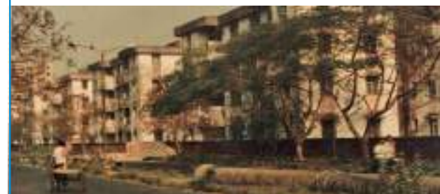
CPWD Staff Quarters, AF Block, Salt Lake