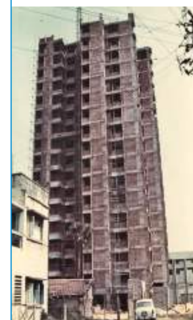
IOL Building, Dhakuria G+19