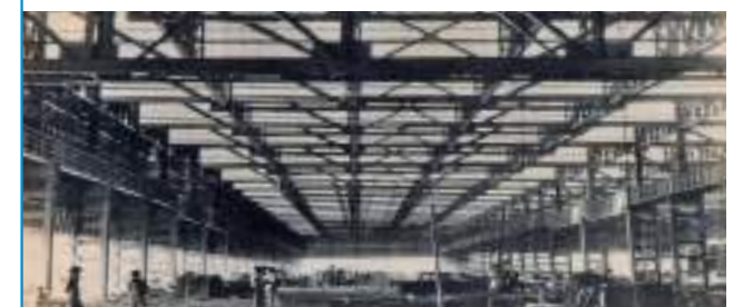
Airport Hanger Work in Progress