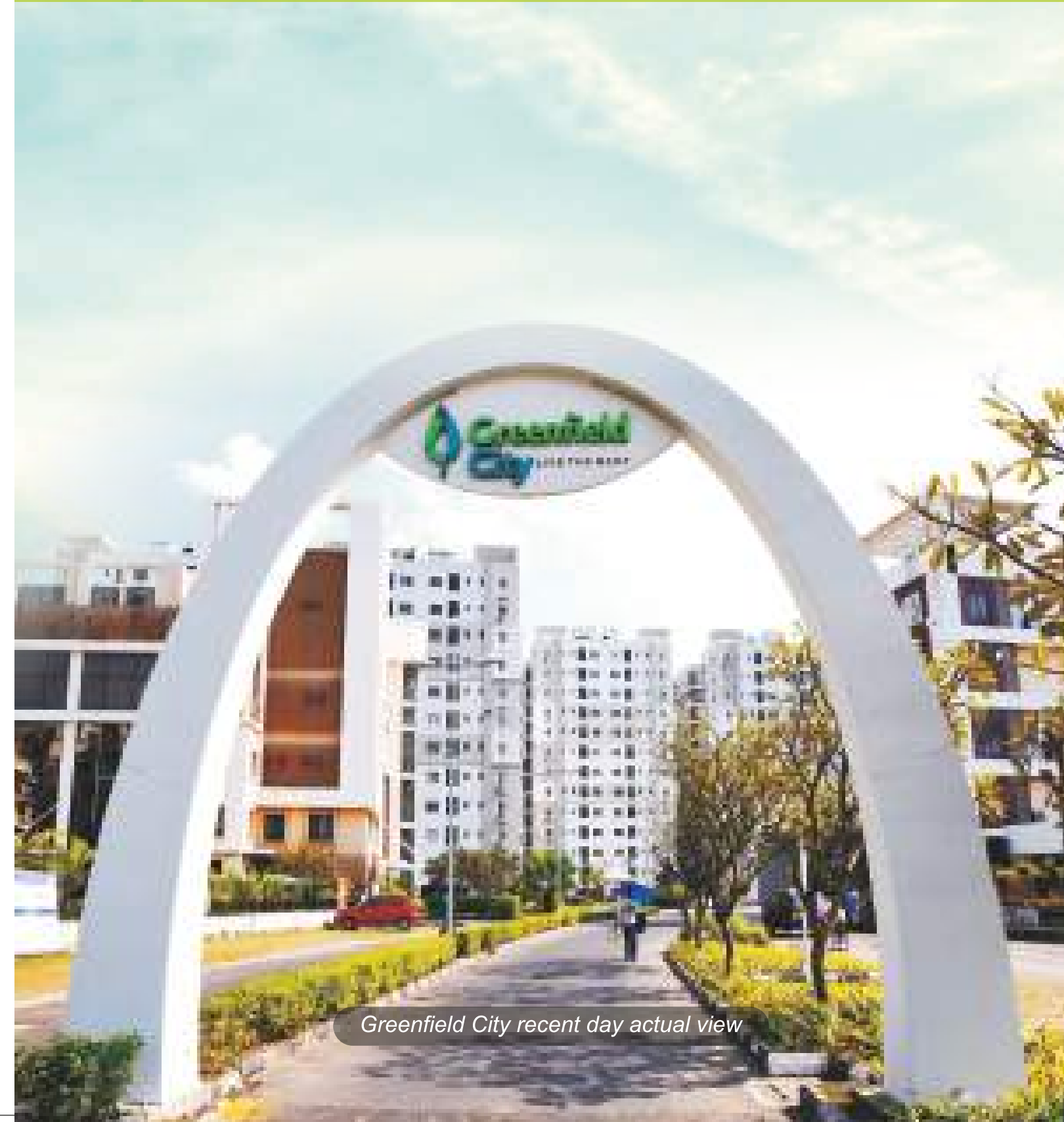
Greenfield City recent day actual view

We have exceptional experience in all phases of commercial site development, including architecture, MEP (Mechanical Electrical & Plumbing) engineering, civil engineering and project management. Contact us to discuss your upcoming commercial development projects. We work hard to provide quality service during each stage of project coordination and implementation.