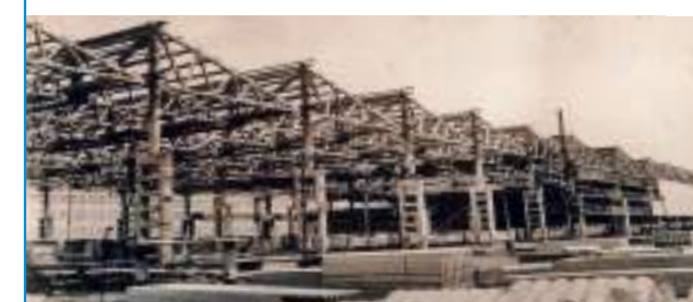
CSTC Bus Terminus work in Progress at Salt Lake

5th Avenue Mahisbatan off Sector V Actual view