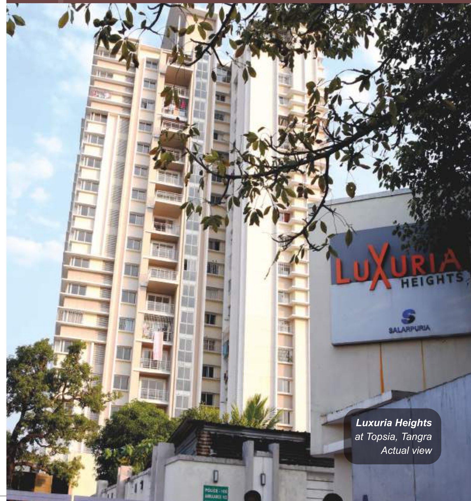
Luxuria Heights at Topsia, Tangra Actual view