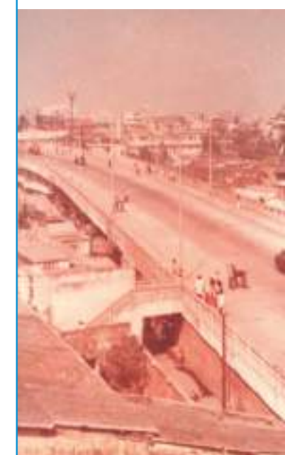
Bijan Setu after Construction