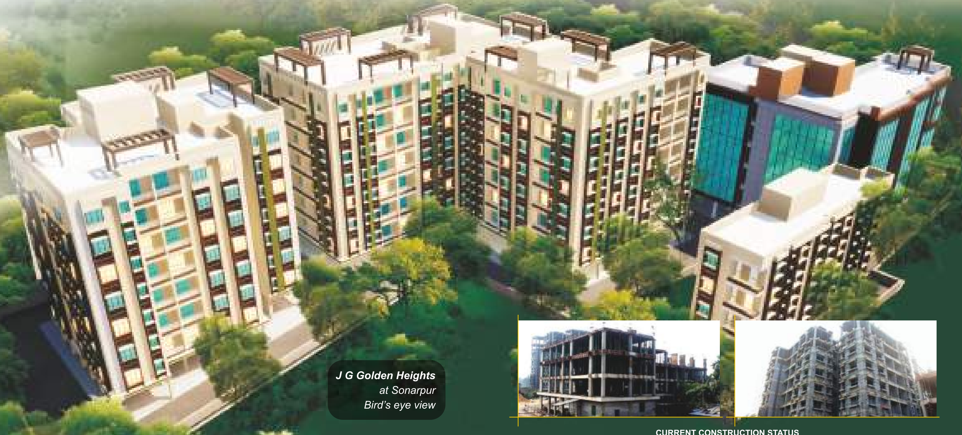
J G Golden Heights at Sonarpur Bird's eye view