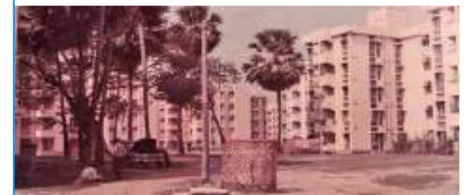
WB Govt. Mass Housing Project at Golf Green