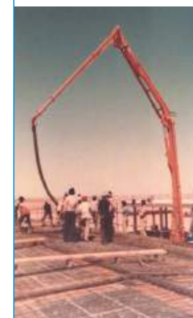
Construction Work at Libya Project