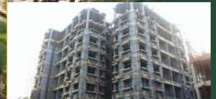
CURRENT CONSTRUCTION STATUS