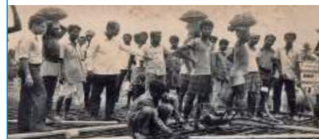
Park Street Metro Station Construction Work in Progress