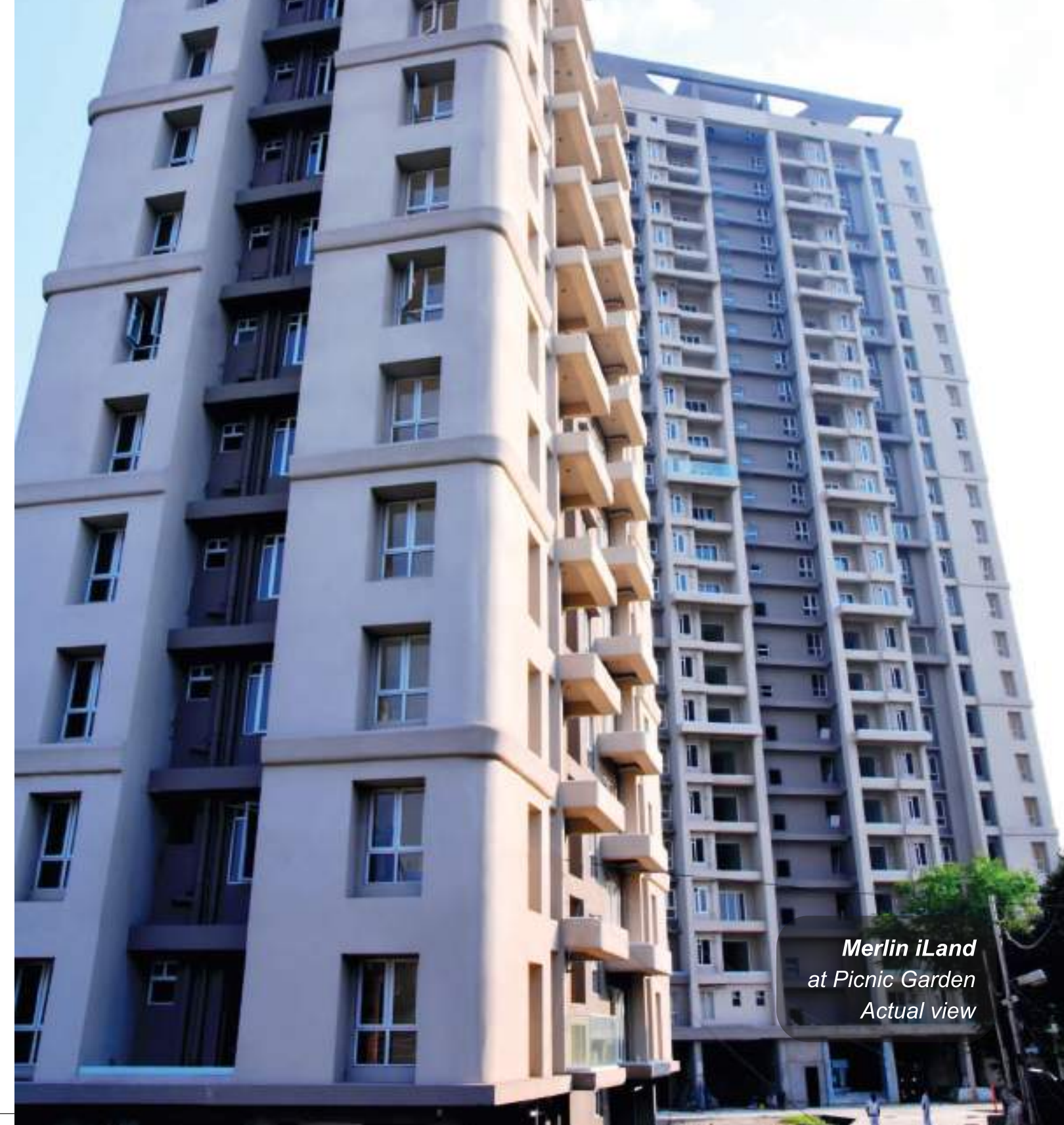
Merlin iLand at Picnic Garden Actual view